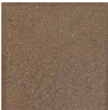
Hybrid Zero Gloss

First test the product on a small, less-observed area of approximately 4 sq. ft. (0.4 m 2 ) to ensure results meet your expectations. Expect final color, variation and shade (lightness-darkness) to vary in most instances. All concrete or natural stone exhibit variations, therefore the sample charts should be used as a general guideline only when selecting sealer type. Color matches cannot be guaranteed.