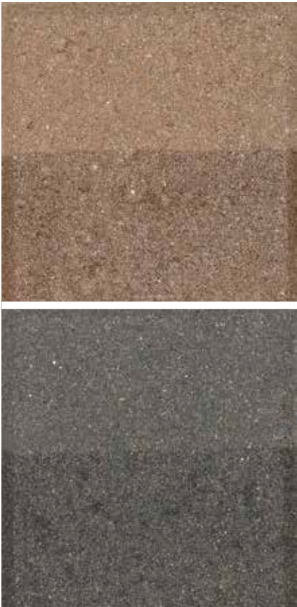
Hybrid Low Gloss +COLOR ENHANCER