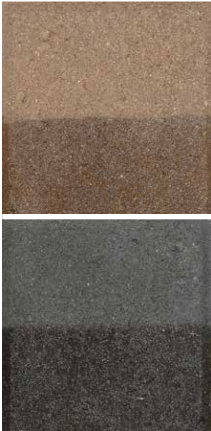
Hybrid High Gloss +COLOR ENHANCER