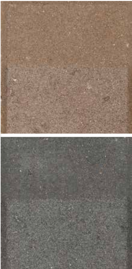
Hybrid High Gloss